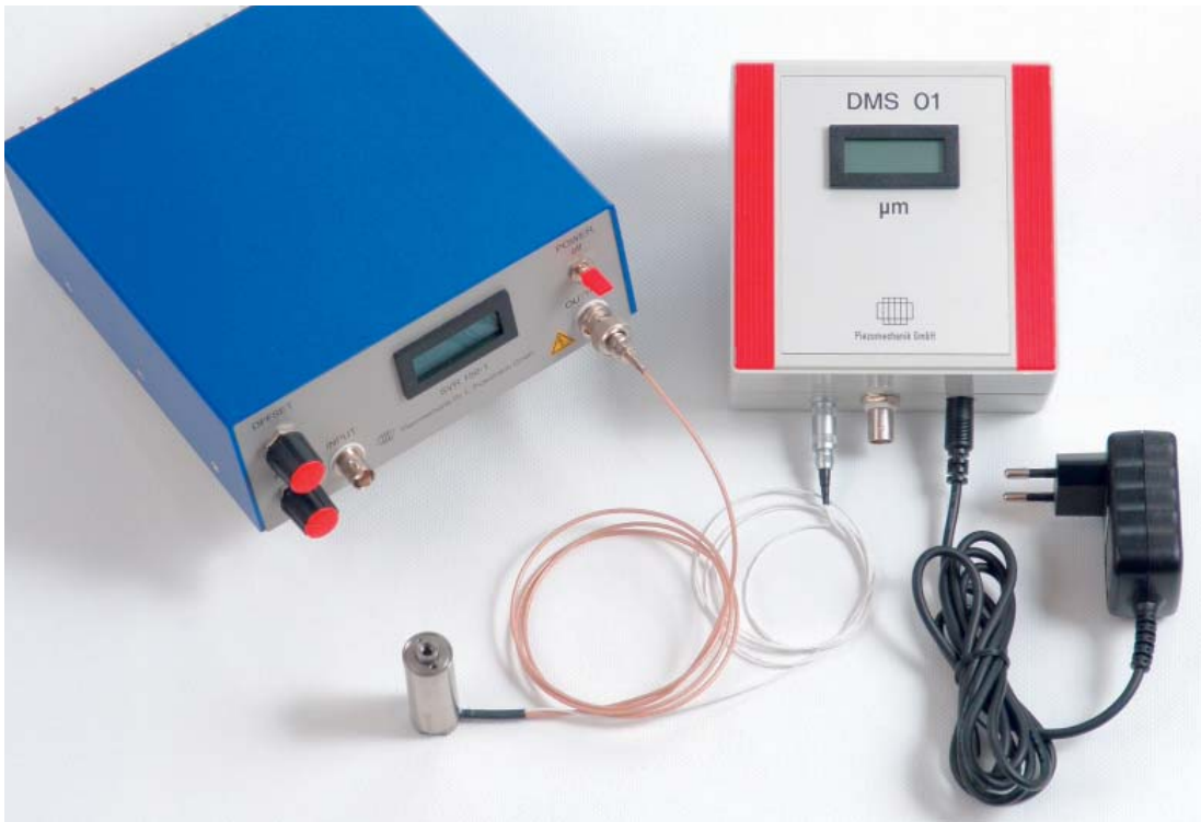
Fig. 1 Strain gage amplifier DMS 01 connected to a piezo actuator with option position sensing and SVR piezo amplifier

Check also PIEZOMECHANIK's actuator catalogues for option "position detection"