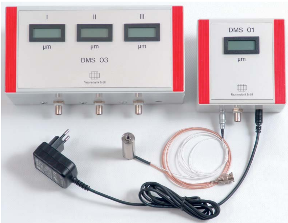
Fig. 3 Strain gage amplifiers DMS01 and DMS 03

Triple channel amplifier, dimensions W x D x H (mm) 240 x 120 x 60, weight 550 g (power supply included)