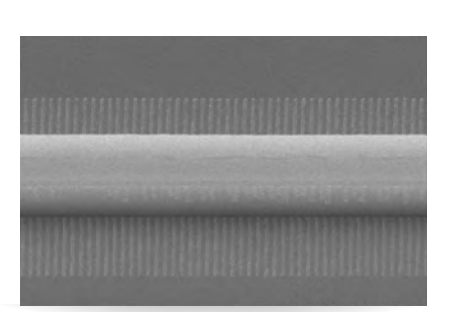
Overgrowth-free DFB device processing

Any custom wavelength is possible: You tell us what you need and we deliver it. With our patented DFB technology we design any wavelength between 760 nm and 14 \mu m .